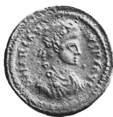
PLATE 27 (All 1.5x)