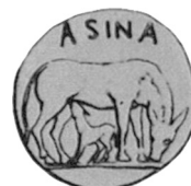
MONDELLO, THE CULT OF THE SAINTS AND ROMAN COMMUNITIES (1)