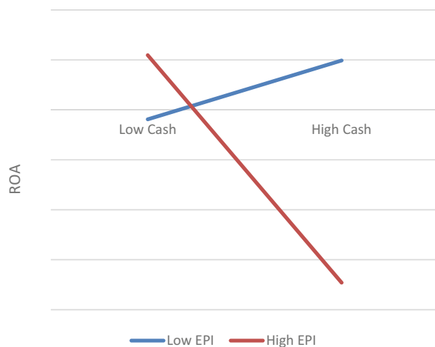
FIGURE 1 Marginal effect of cash holdings on firm performance moderated by country environmental performance. [Colour figure can be viewed at wileyonlinelibrary.com ]

being substitutes, the findings are in line with those of Cariola et al. (2020), according to whom, in countries where the environmental performance index is high, the use of debt by energy SMEs is more valuable.