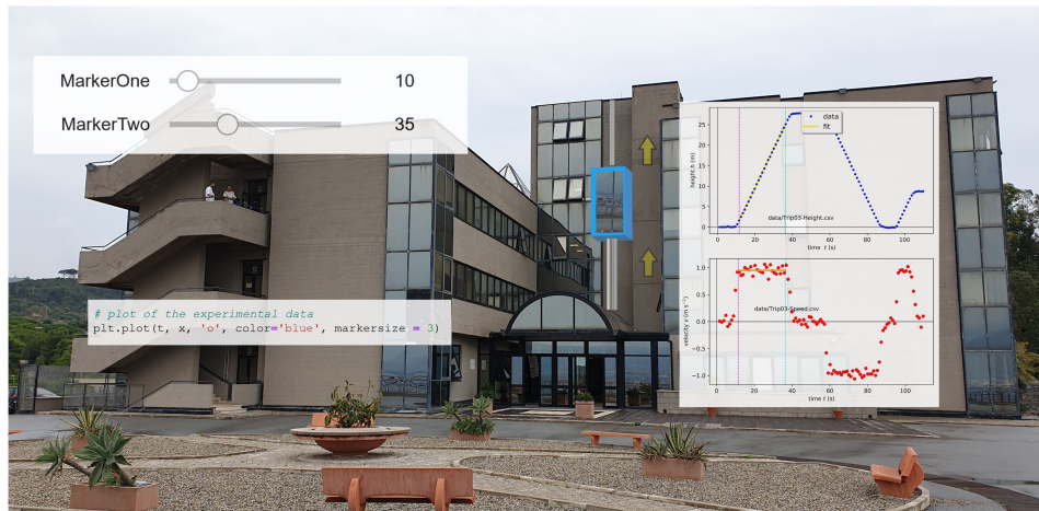
FIGURE 2. “Trip on a lift: experiment and data analysis” is one of the activities proposed in the workbook.

Other specific advanced examples could be developed concerning: 1) how to plot a graph using a selected image as background; 2) how to select frames from a video; how to get data from a video frame in order to detect the position of an object during its motion (see Figure 1).