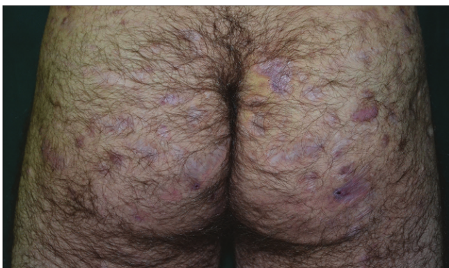
Figure 1c: Skin lesions at 6 months' follow-up