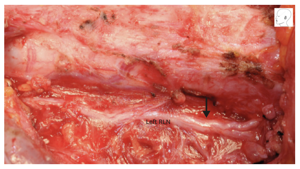
Fig. 1. The clinical case presentation. Intraoperative evidence of first left RLN injury. Nerve lesion is not visible to surgeon's eye. Only EMG evaluation can confirm injury. Type 1 lesion (black arrow) was caused by excessive traction on the thyroid gland at Berry's ligament. RLN = recurrent laryngeal nerve.