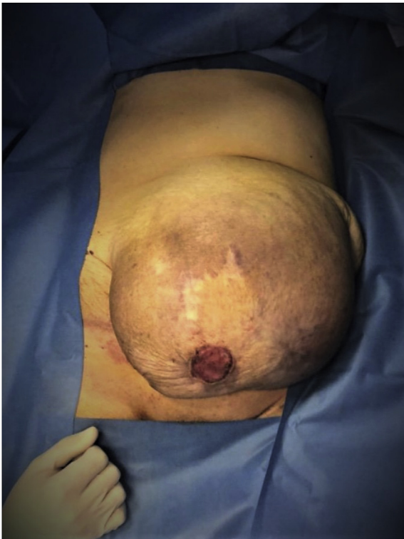
Fig. 1. Massive, circumferential, tender, irreducible paraumbilical hernia with ulcerated areas of overlying skin.

tender, irreducible supraumbilical mass (transverse diameter of about 30 cm) with ulcerated areas of overlying skin was noted (Fig. 1).