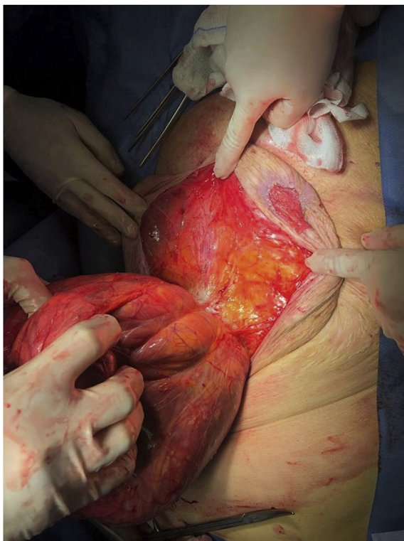
Fig. 3. Isolated paraumbilical hernia sac protruding through the abdominal wall defect.

in the absence of typical risk factors for pancreatitis. An IV contrast-enhanced abdominal CT scan should be performed immediately in these patients. We recommend the patients and the surgeons to consider prompt surgical repair for paraumbilical hernias, particularly in high-risk patients, to avoid the risk of incarceration and strangulation and the higher incidence of morbidity and mortality associated with emergency surgeries.