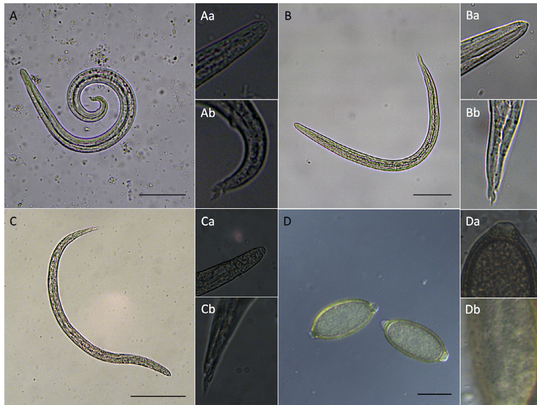
Fig. 3. Feline lungworm infections diagnosed during this study (scale bars = 100 \mu\text{m} ). L1s of Aelurostrongylus abstrusus (A), Troglstrongylus brevior (B), and Oslerus rostratus (C), with magnifications of the anterior (Aa, Ba, Ca) and posterior extremities (Ab, Bb, Cb). Eggs of Eucoleus aerophilus (D), with particulars of the polar plug (Da) and of the net-like surface of the egg (Db).