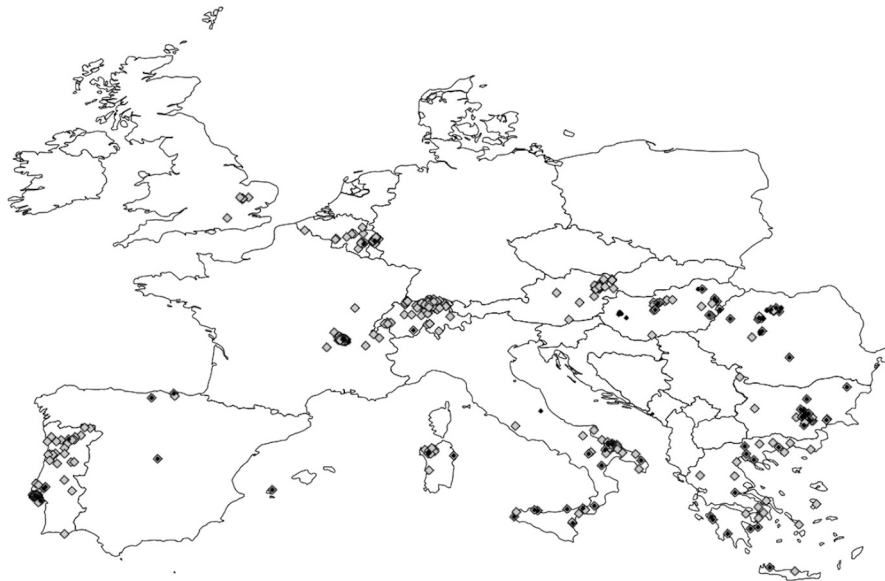
Fig. 1. The geographical distribution of cats in this study which were infected by lungworms. Grey-shaded squares represent locations where cats were free of infection, and black squares represent locations where infected individuals were detected. Where cats were collected from the same location, some markers overlie each other.