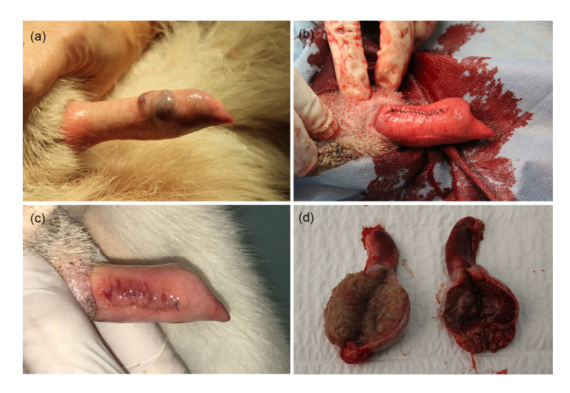
Figure 1. Clinical evaluation of penile lesion. ( a ) Appearance of the injury on the unsheathed penis. ( b ) Appearance of the lesion during blood engorgement. ( c ) Appearance of the surgical wound on the glans penis at follow up. ( d ) Appearance of the testicles cut longitudinally.

swelling was not painful and showed the tendency to engorge with blood when a slight pressure was applied on the organ (Figure 1a). The owner had noticed the lesion almost two months prior, and the routine tests conducted were within the normal range. The lesion did not undergo any remarkable change since the first evidence.